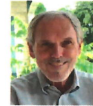
(✉ Corresponding Author)

1,2,3,4 Orelana Harvoks Puckett Institute, United States